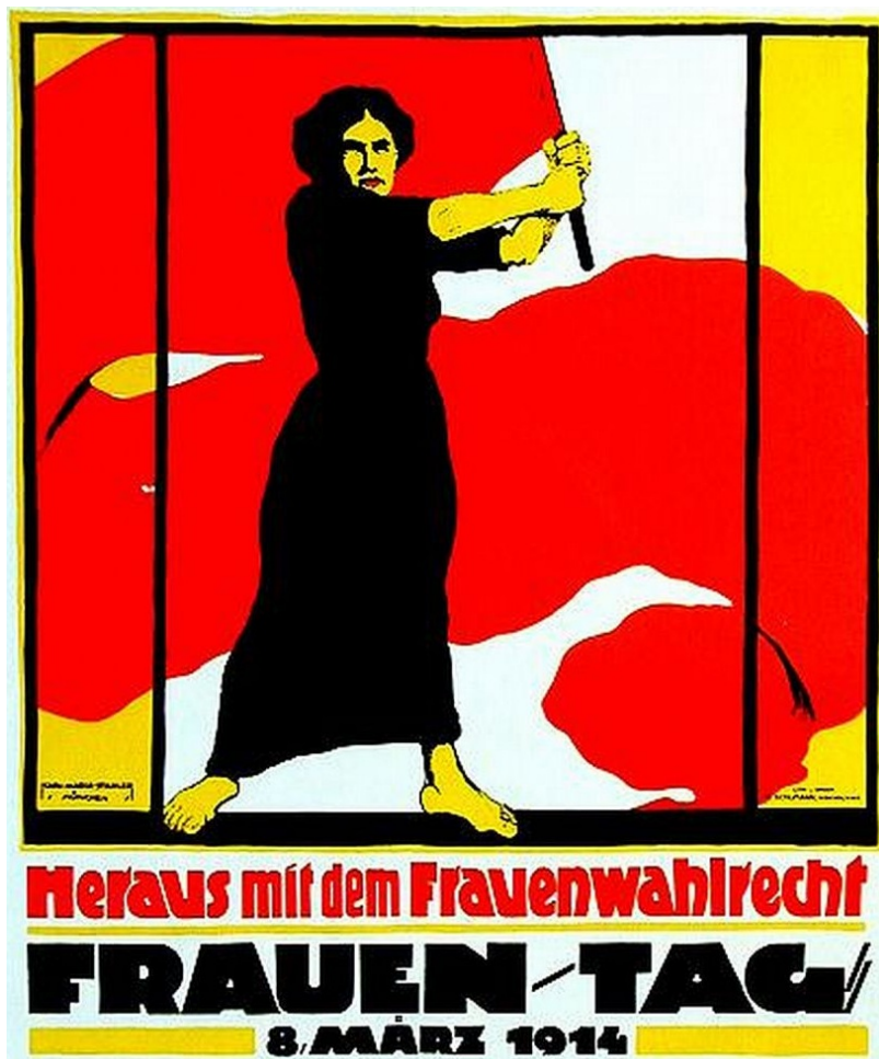
International Women's Day, 1914

International Women's Day is a Workers' Day!